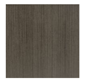
Laminex® Multipurpose Compact Laminate Licorice Linea