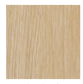
Laminex® Multipurpose Compact Laminate Calm Oak