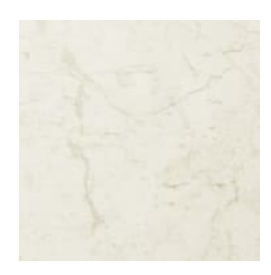
Laminex® Multipurpose Compact Laminate White Valencia