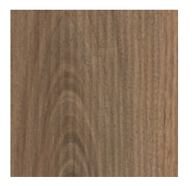
Laminex® Multipurpose Compact Laminate Natural Walnut