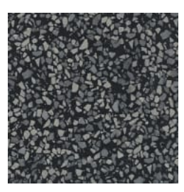
Corian® Solid Surface Basalt Terrazzo