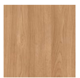
Laminex® Multipurpose Compact Laminate Elegant Oak