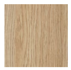
Laminex® Multipurpose Compact Laminate Classic Oak