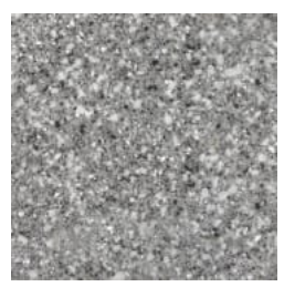
Corian® Solid Surface Platinum