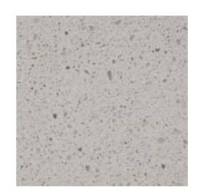
Laminex® Multipurpose Compact Laminate Limed Concrete