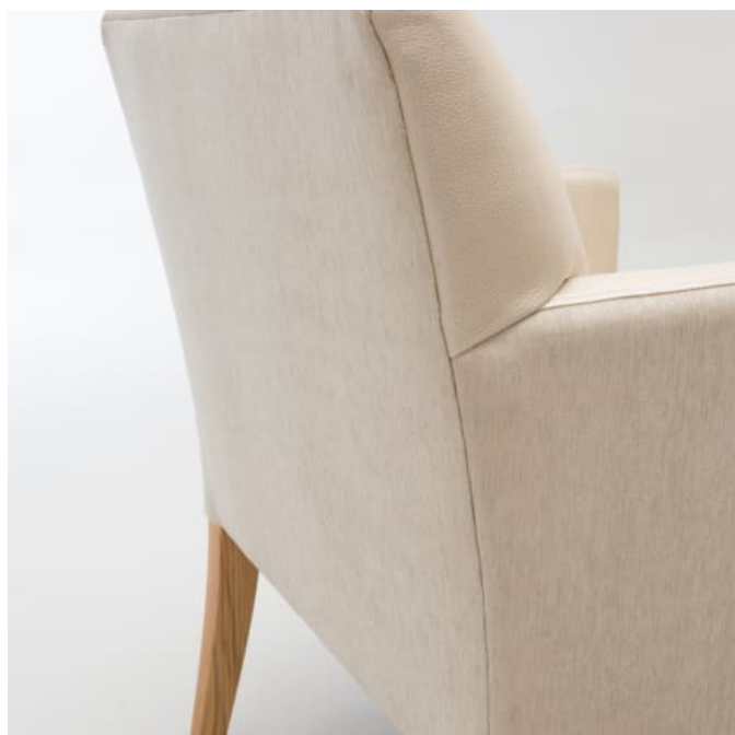
Pippi Armchair Back Detail