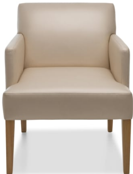
Pippi Armchair Front