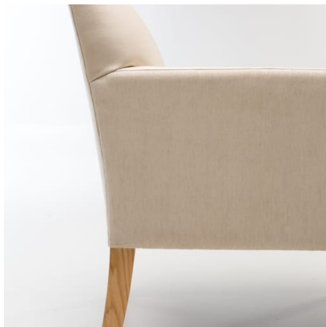
Pippi Armchair Side Detail