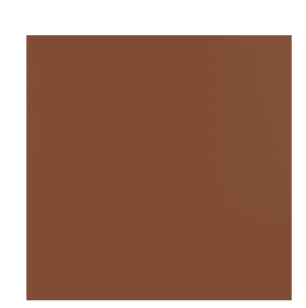
Territory Red - Matt