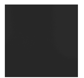
Charcoal - Satin