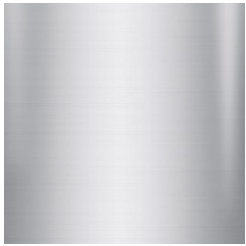
Marine-Grade 316 Stainless Steel