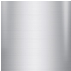
Marine-Grade 316 Stainless Steel