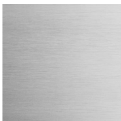
Stainless Steel Satin Finish