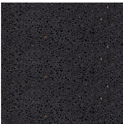
Precast Concrete Black Marble Brushed