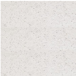
Precast Concrete White Granite Sandblasted