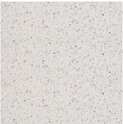
Precast Concrete White Granite Brushed