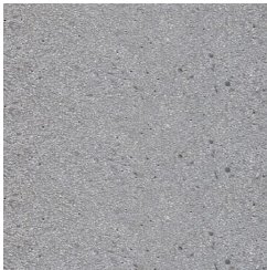
Precast Concrete Grey Granite Sandblasted