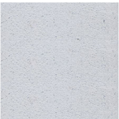
Precast Concrete White Marble Sandblasted