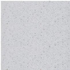
Precast Concrete White Marble Brushed