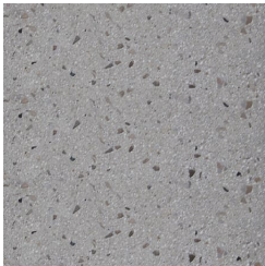
Precast Concrete Grey Granite Brushed