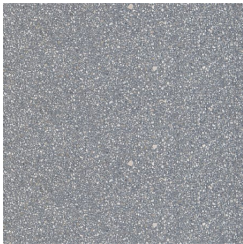
Precast Concrete Dark Grey Polished