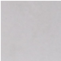
Precast Concrete Grey Velluto Natural Smooth