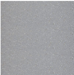
Precast Concrete Grey Polished