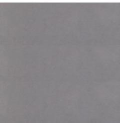
Precast Concrete Dark Grey Velluto Natural Smooth