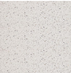
Precast Concrete White Granite Brushed