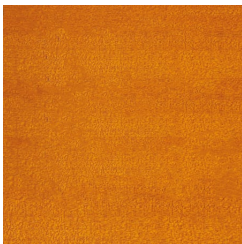
Hardwood Akoume Varnished