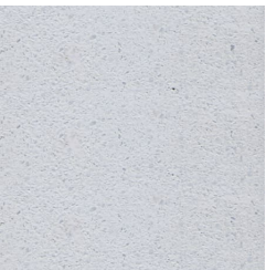
Precast Concrete White Marble Sandblasted