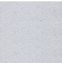
Precast Concrete White Marble Sandblasted