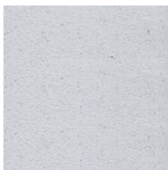
Precast Concrete White Marble Sandblasted