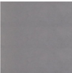
Precast Concrete Dark Grey Velluto Natural Smooth