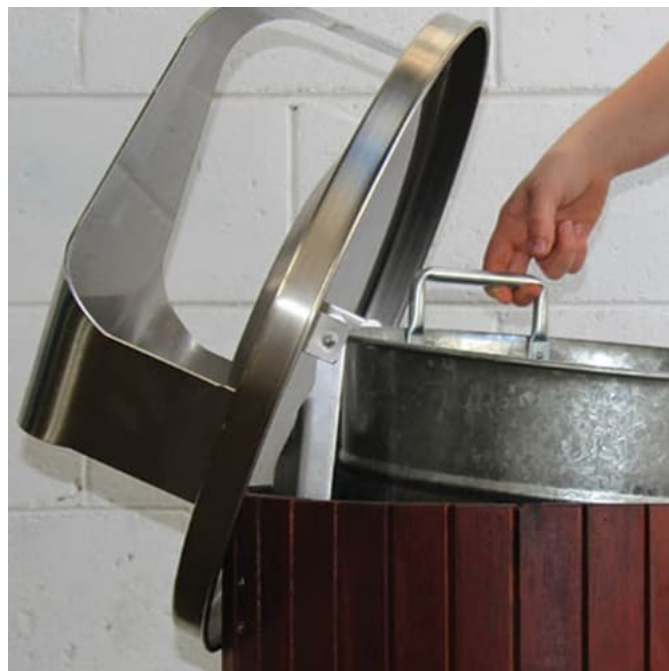
Bronte Litter Bin Single Hinged Pacific Hood Detail