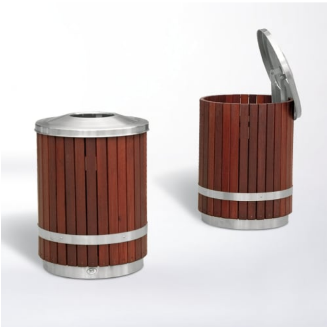
Bronte Litter Bin Single Hinge Lid Detail