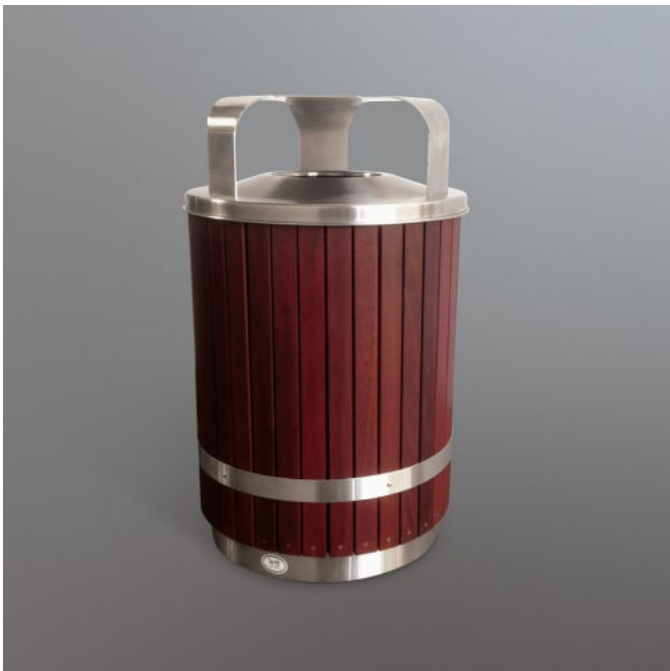
Bronte Litter Bin Single Hinge Lid Detail 2