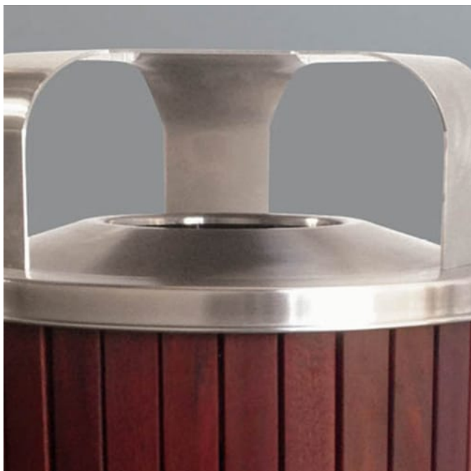
Bronte Litter Bin Single Pacific Hood Detail