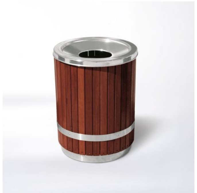
Bronte Litter Bin Single Detail