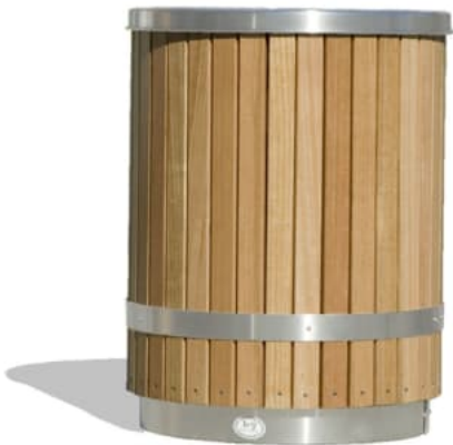
Bronte Litter Bin Single Detail 3