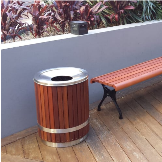
Bronte Litter Bin Single Concave Lid