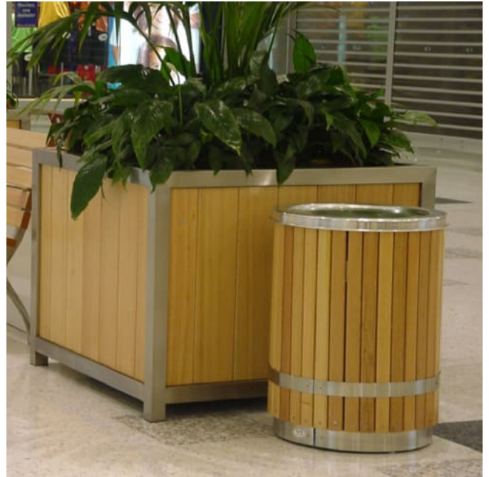
Bronte Litter Bin Single Install