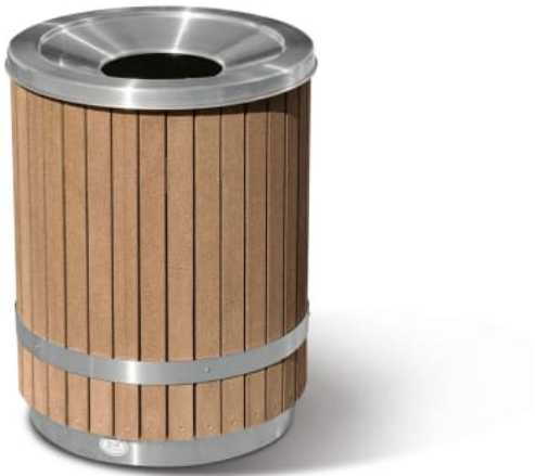
Bronte Litter Bin Single Detail 2