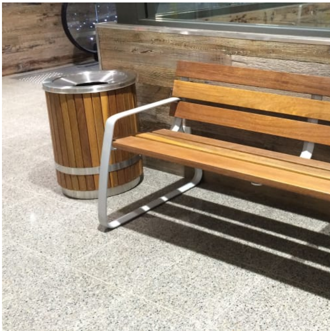
Bronte Litter Bin Single Install 2