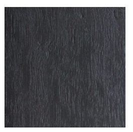
Hardwood Mixed Red UV-Resistant Ebony Oil