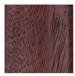
Hardwood Mixed Red UV-Resistant Mahogany Oil