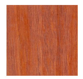
Hardwood Mixed Red UV-Resistant Pine Oil