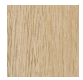
Laminex® Multipurpose Compact Laminate Calm Oak