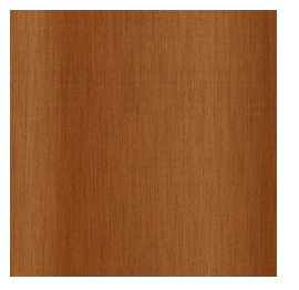
Hardwood Spotted Gum UV-Resistant