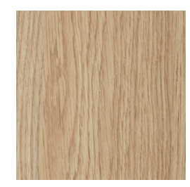
Laminex® Multipurpose Compact Laminate Classic Oak