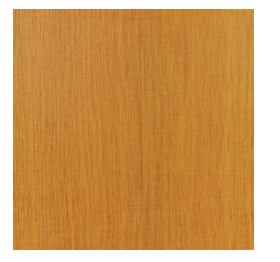
Hardwood Blackbutt UV-Resistant Oil