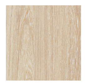
Laminex® Multipurpose Compact Laminate Seasoned Oak