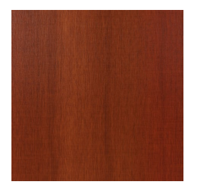
Hardwood Merbau UV-Resistant Oil