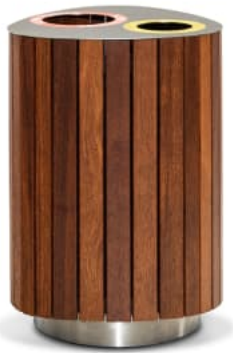
Avoca Litter Bin Double Detail