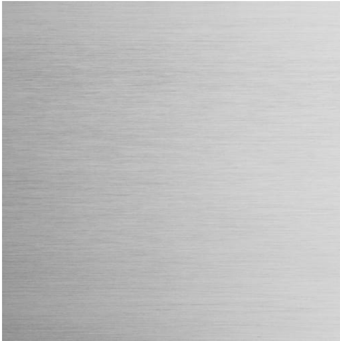
Stainless Steel Satin