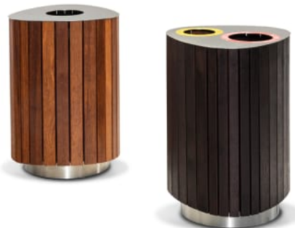
Avoca Litter Bin Single + Double Detail