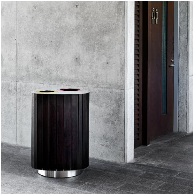
Avoca Litter Bin Double Install