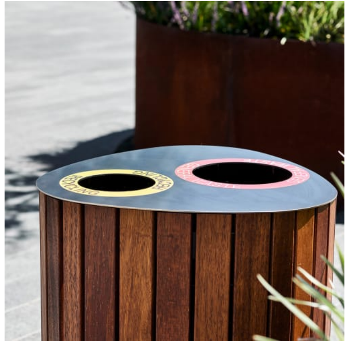
Avoca Litter Bin Double Lid Detail