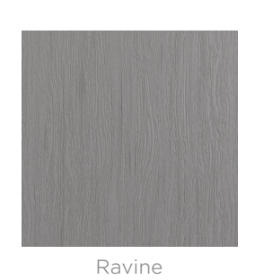
B+G Powder Coat - Core AU