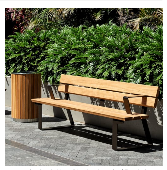
Mandalay Single Litter Bin - Hardwood w/ Terrain Seat