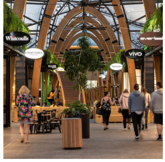
Mandalay Single Litter Bin - Botany Garden Lane