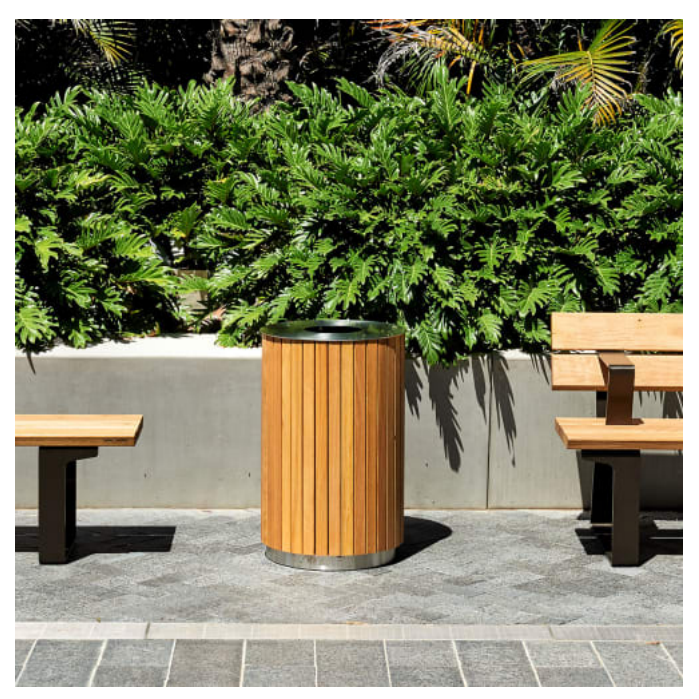
Mandalay Single Litter Bin - Hardwood