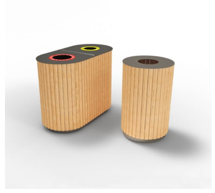
Mandalay Single and Double Detail